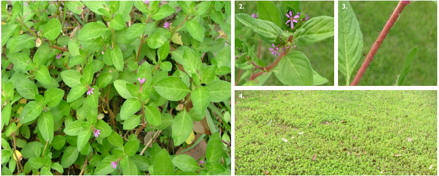
1. Habit growing in a lawn area 2. Leaves and small flowers with six petals 3. Close-up of stem covered with sticky hairs 4. Dense infestation in a park at Helensvale