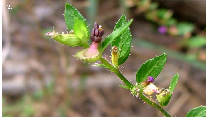
1. Habit growing along a footpath 2. Close-up of brown seeds