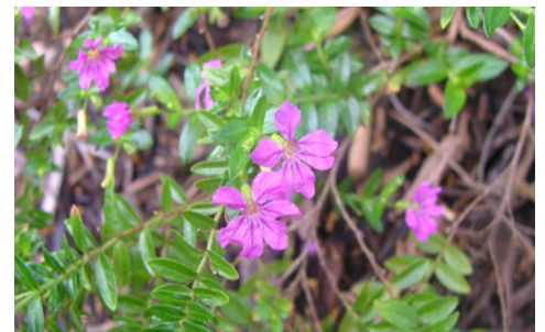
Top. Habit of Mexican heather