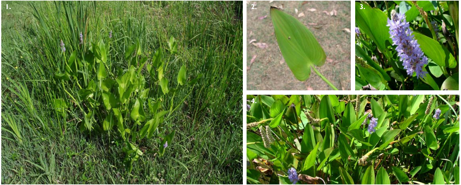
1. Small population in a roadside drain on the Gold Coast. 2. Heart-shaped leaf blade. 3. Dense spike-like flower cluster with numerous bluish flowers 4. Habit of Pickerel weed