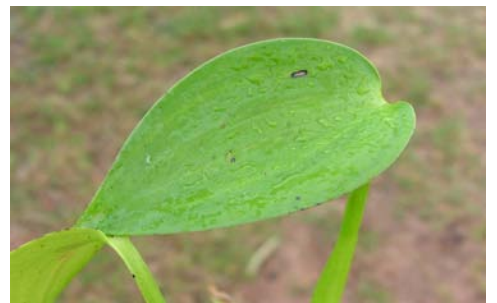
Top. Spreading habit of monochoria .