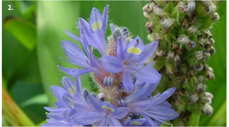
1. Immature fruit. 2. Close-up of flowers with yellow spot on one petal.