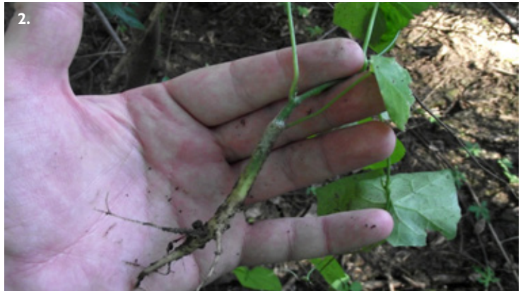
1. Close-up of female (left) and male (right) flowers. 2. Young plant with thick tuberous root beginning to develop.