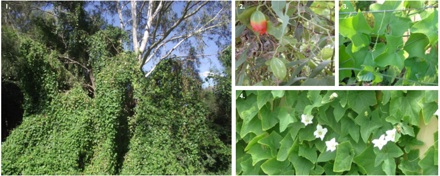
1. Infestation smothering she-oak trees along Wolston Creek in Riverhills. 2. Immature and mature fruit. 3. Leaves and coiled tendrils. 4. Habit growing on a fence.