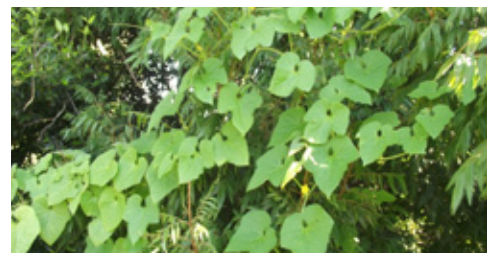
Top. Native bryony with smaller flowers and young fruit.