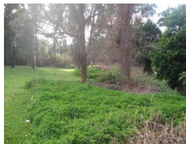
After first treatment

Protecting biodiversity is one of the most important issues facing Australians today. Technigro plays an integral role in assisting local government, developers and private companies in delivering programmed bushland restoration within South East Queensland. With over 20 years experience in the vegetation management industry, Technigro has developed innovative technologies that significantly reduce human impact when working within these sensitive natural areas.