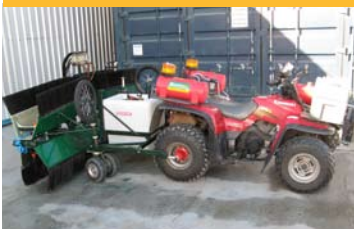
4m DriftProof spray unit