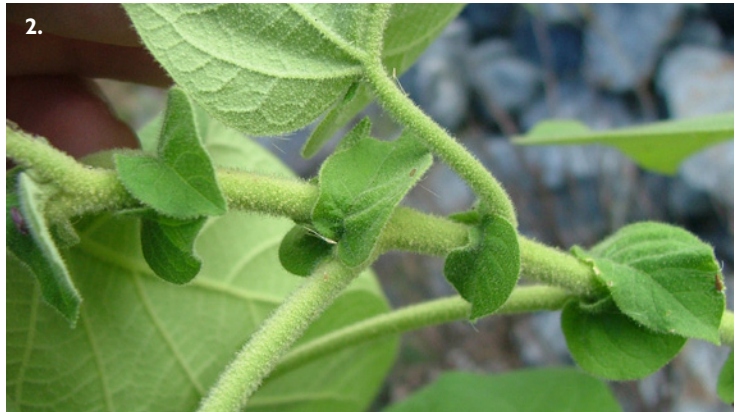
1. Young plant. 2. Close-up of hairy stems showing pairs on small leafy structures in leaf forks.