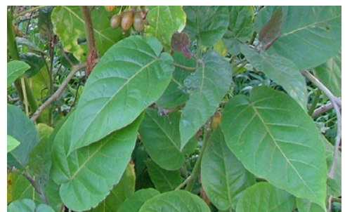
Top. Purple flowers and round fruit of Wild Tobacco. Bottom. Heart-shaped leaves and drooping fruit of Tamarillo.

The control methods referred to in Weed Watch™ should be used in accordance with the restrictions (federal and state legislation and local government laws) directly or indirectly related to each control method. These restrictions may prevent the utilisation of one or more of the methods referred to, depending on individual circumstances. While every care is taken to ensure the accuracy of this information, Technigro does not invite reliance upon it, nor accept responsibility for any loss or damage caused by actions based on it.